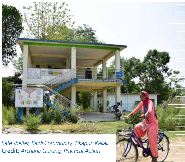
Safe shelter, Baidi Community, Tikapur, Kailali