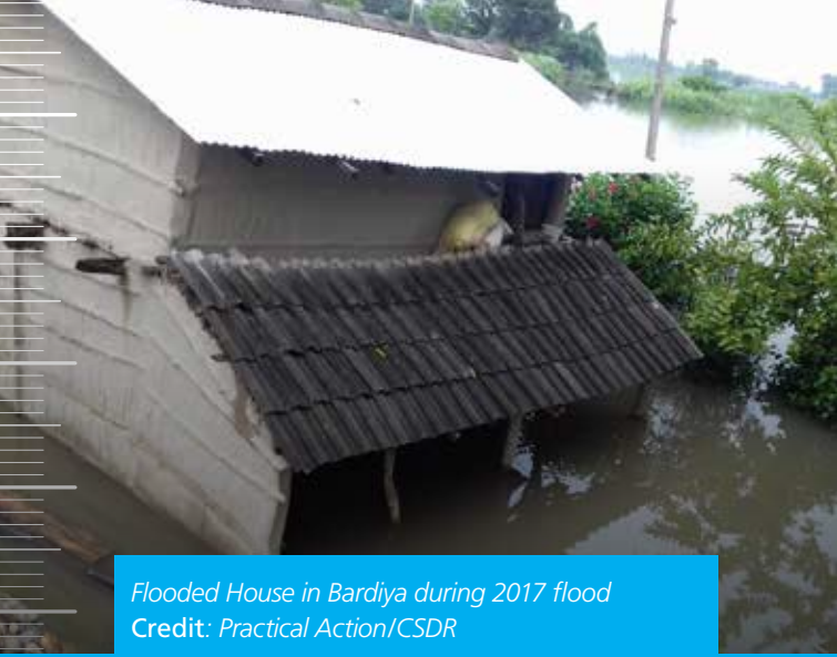
Flooded House in Bardiya during 2017 flood