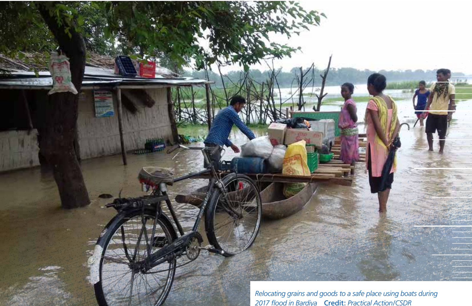
Relocating grains and goods to a safe place using boats during 2017 flood in Bardiya