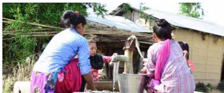
Flood resilient raised tube well in Kailali

The International Federation of Red Cross and Red Crescent Societies (IFRC) is the world's largest humanitarian network that reaches 150 million people in 190 countries through the work of over 17 million volunteers. In Nepal, IFRC supports the Nepal Red Cross Society (NRCS) to advocate for the nationwide scale-up of community resilience-building efforts through different forums such as the Humanitarian Country Team (HCT) and the Community-Based Disaster Risk Management (CBDRM) Platform. As a Secretariat of the CBDRM Platform, NRCS and IFRC engage in policy dialogue with various stakeholders and support the dissemination of best practices in community programming, emphasizing the role of local actors in sustaining local development strategies that leave no one behind.