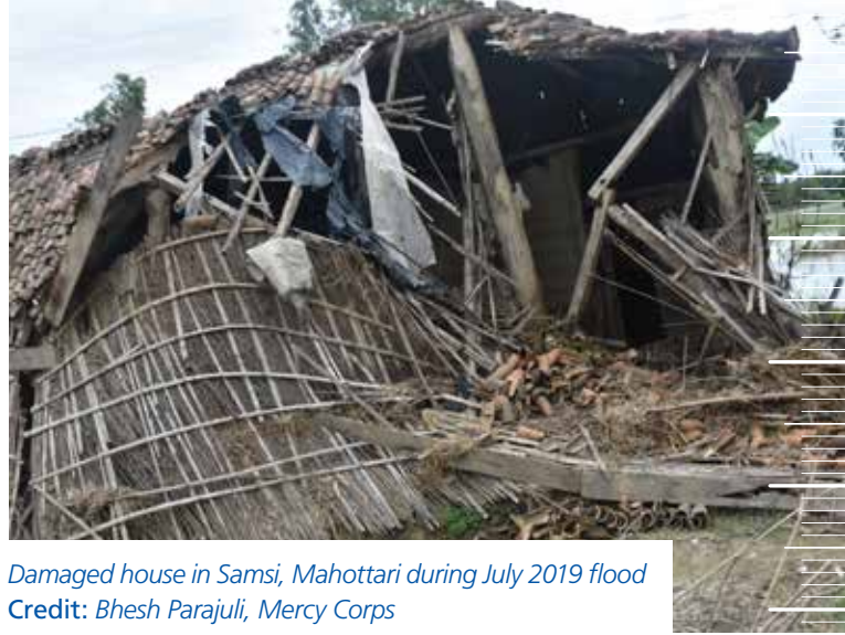
Damaged house in Samsi, Mahottari during July 2019 flood

IFRC will provide policy and coordination support to the Alliance in Nepal through its role as a Secretariat of the national CBDRM Platform and strong community resilience-building programmes of NRCS in Nepal. We will also support seven flood-prone municipalities to develop local strategies and tools for effective flood risk reduction and community resilience that are aligned with nationally agreed approaches towards disaster risk reduction and management.