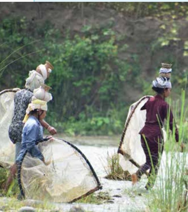
Tharu women fishing in the Karnali River

The Flood Resilience Measurement for Communities (FRMC) framework comprises two parts: The Alliance's framework for measuring community flood resilience and an associated tool for implementing the framework in practice.